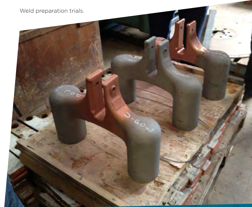
Weld preparation trials.